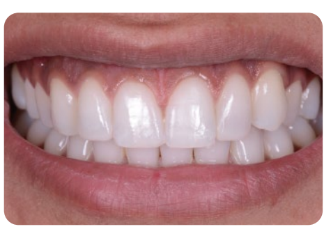
After Enlighten whitening